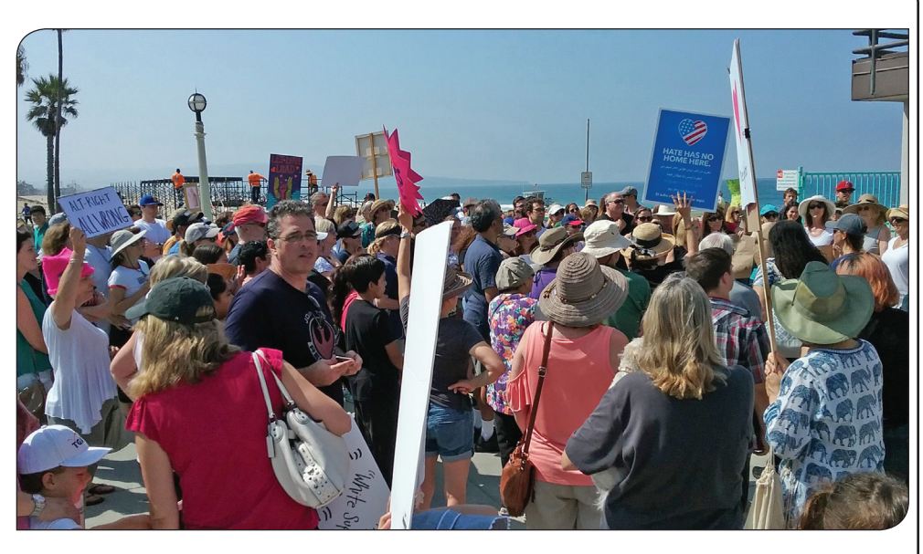
The South Bay's rally response to Charlottesville at the Manhattan Beach Pier

released, Al Gore provides us with an updated and expanded narrative that provides recent catastrophic climatic events as proof of the reality of climate change and the necessity to switch off of fossil fuels. His painstaking data squarely demonstrates the effects of global warming and illustrates how far ahead of the US many countries are in the guest for sustainable power. How quickly, actually even exponentially, the use of solar power has grown in certain parts of the world; the graphic on Chile's move to solar is simply jaw-dropping and worth the price of admission alone. It serves as a loud and clear example that we could and should be doing the same.